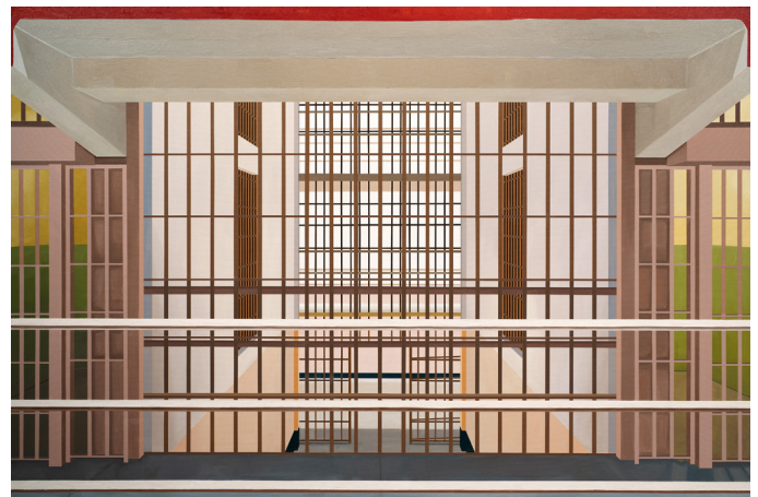
Sarah McKenzie, View From the Second Tier (Alcatraz) , 2022, oil and acrylic on canvas, 48 x 72 in. (121.9 x 182.9 cm)