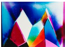
Liz Nielsen Underwater Mountains , 2018 Analog chromogenic photogram on Fujiflex 30 x 40 in. (76.2 x 101.6 cm) 31.25 x 44 in. (79.4 x 111.8 cm), framed (LN 1804)