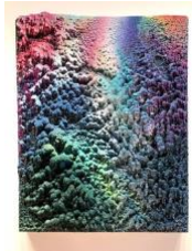
Dylan Gebbia-Richards Refracted , 2018 Wax on panel 48 x 60 x 9 in. (121.9 x 152.4 x 22.9 cm) (DG 1802)