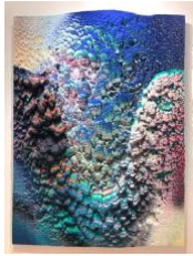
Dylan Gebbia-Richards Above the Clouds , 2018 Wax on panel 96 x 72 x 13 in. (243.8 x 182.9 x 33 cm) (DG 1801)