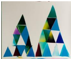
Liz Nielsen Mountain Friends , 2018 Analog chromogenic photogram on Fujiflex 40 x 50 in. (101.6 x 127 cm) (LN 1801)