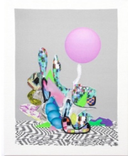
David B. Smith Pile (purple) , 2021 Textile collage on wood 23 x 18 in. (58.4 x 45.7 cm) (DBS 2125)