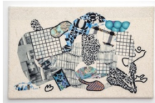
Photo-based archival dye print on velvet on wood 26 x 39 in. (66 x 99.1 cm) (DBS 2111)