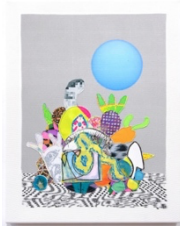
David B. Smith Pile (blue) , 2021 Textile collage on wood 23 x 18 in. (58.4 x 45.7 cm) (DBS 2124)