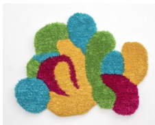
Photo-based dye sublimation print on polyester faux shearling on wood 22 x 36 in. (55.9 x 91.4 cm) (DBS 2110)